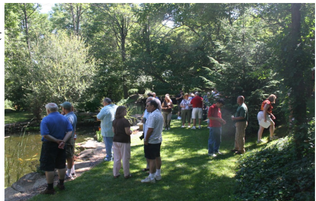
PICTURE FROM 2007 POND TOUR

You have done a lot of hard work creating your backyard oasis, why not share it with others that have the same interest as you, please think about being on this years Pond Tour, we have a lot of great people in this group