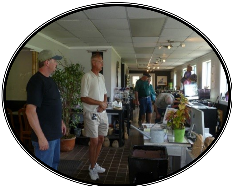
Serene Gardens Store