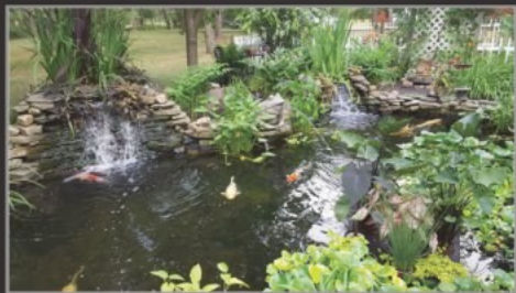
WILKOLASKI POND