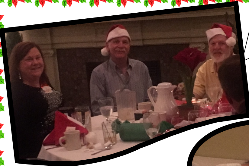
NFKPC Christmas Party 2015