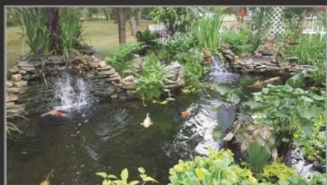
WILKOLASKI POND